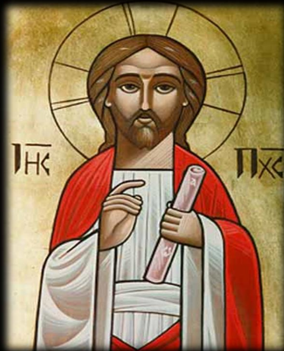
The Incarnate Word