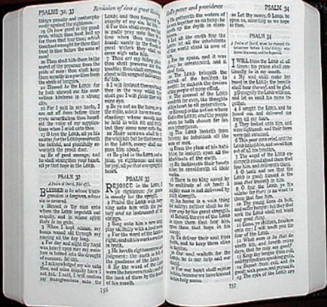
The Written Word